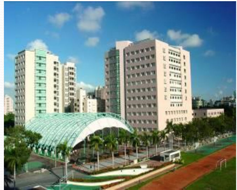
Kaohsiung Medical University 1 st Aug. 1999