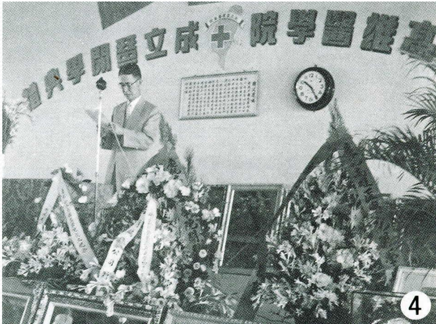
Kaohsiung Medical College 16 th Oct. 1954